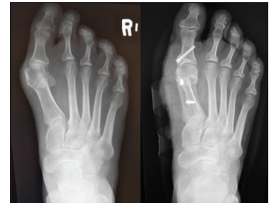
Pre and post op radiographs of scarf and Akin osteotomy. The foot has narrowed with correction of deformity. The intermetatarsal angle has reduced as has the hallu valgus angle.

When the patient presents with symptoms, including pain and problems with shoe wear. When they ask for options for correction of the condition.